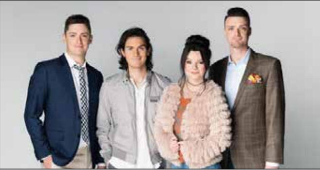
▲ The Erwins