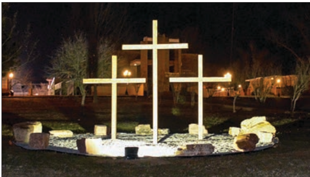
▲ Completed display of crosses at night on the Jacksonville College campus

If Jacksonville College is to be of any value, it must also have revival. During this Easter season, please pray for revival on our campus and across our nation.