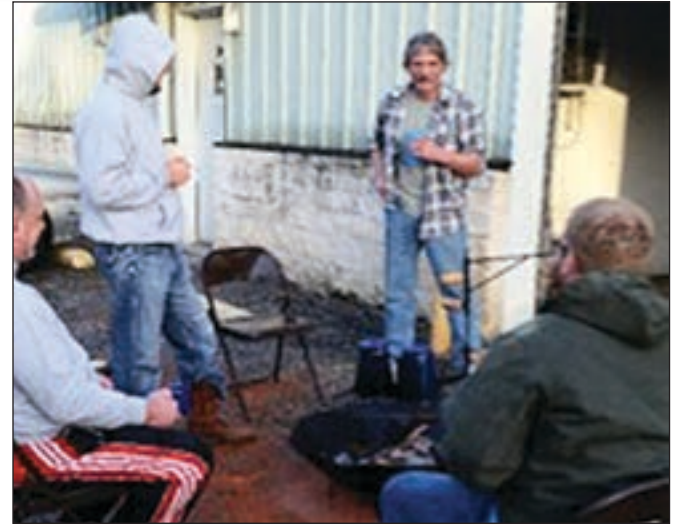
▲ Men's Fire Pit