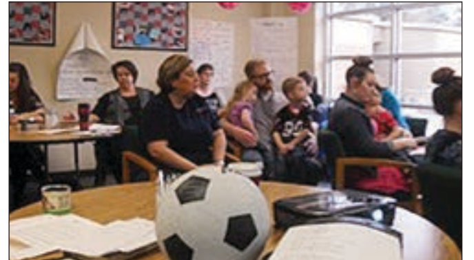
▲ Ladies Bible Study