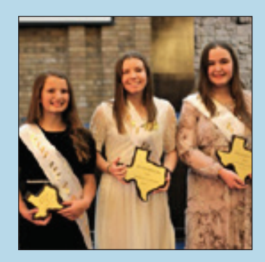
PAGE 14 GMA—STANDING FIRM IN THE FAITH