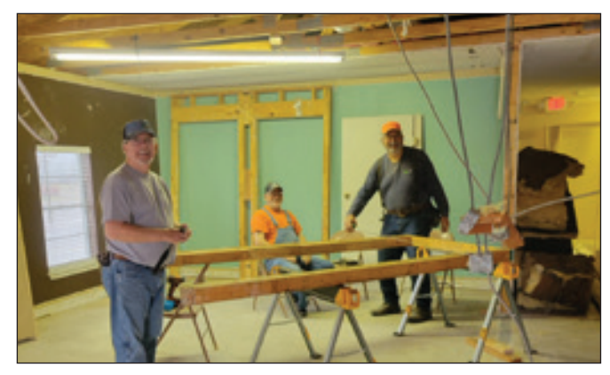
▲ The Master's Builders working at Anthony Drive, Ennis

Also, like us on Facebook at "The Master's Builders," to follow us and pray for us.